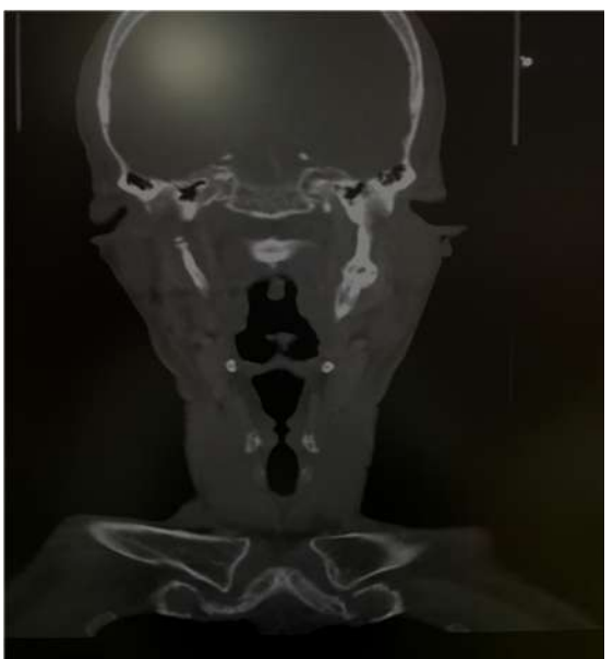
Fig.1, CT scan in bone window sagittal and coronal reformatted views demonstrating elongated styloid process causing mass effects over adjacent soft tissues.