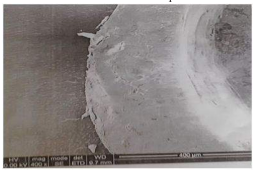
Figure: 1b The SEM of Guttapercha with 10% hydroxyapatite material after push out test

Figure: 1 a The SEM of Guttapercha in Phosphate Buffer Saline Solution after push out test