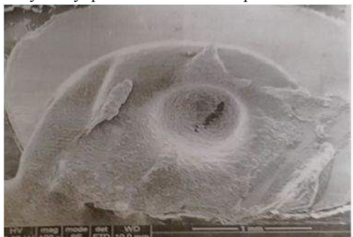
Figure: 2a SEM Of Polyurethane with 10 hydroxyapatite (HA) after push out test