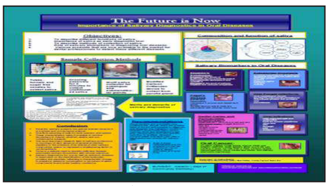
2<sup>nd</sup> Position Poster Titled: Importance of Salivary Diagnostics in Oral Diseases