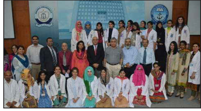
Group Photo with Director General, Judges and Departmental Faculty