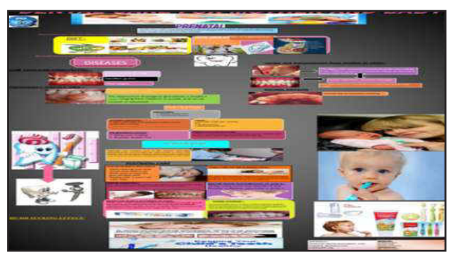
3<sup>rd</sup> Position Poster Titled: Dental Care for Mother and Child