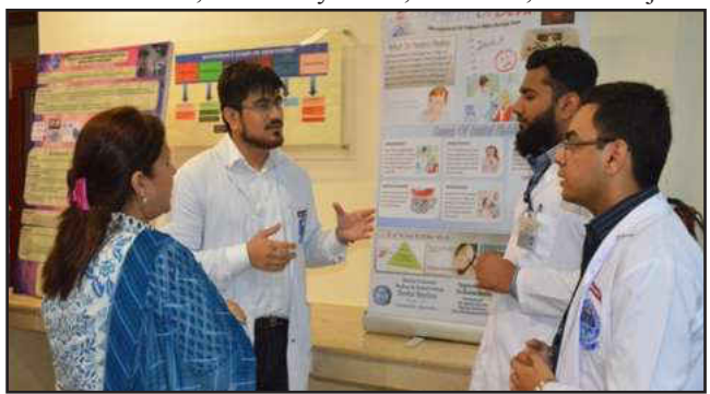
Students Presenting before a Judge for Poster Evaluation