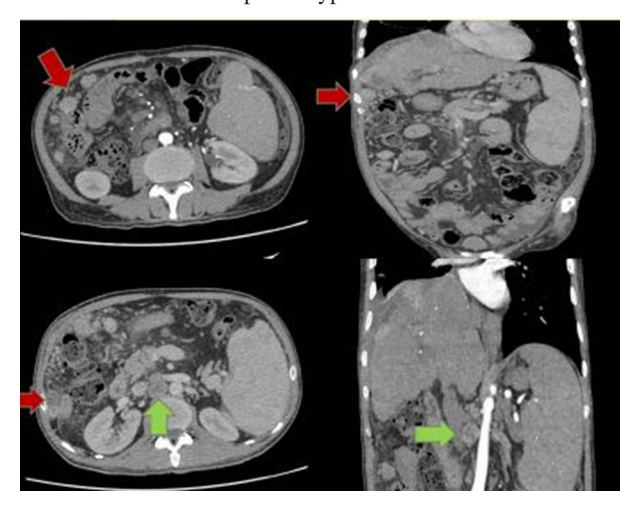
Figure 2: CECT abdomen with reformatted images. Note a collection in right perihepatic space secondary to tumor rupture and multiple cardio phrenic and peritoneal deposits

Figure 1: Axial and coronal CECT abdomen shows arterially enhancing tumor in a cirrhotic liver with multiple peritoneal deposits and portal hypertension.