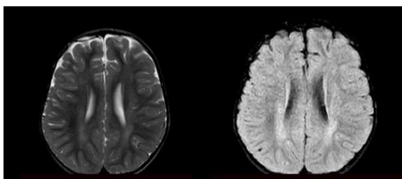
Figure 3. T2W and FLAIR images showing multicystic Encephalomalacia in bilateral frontoparietal lobes with brain atrophy